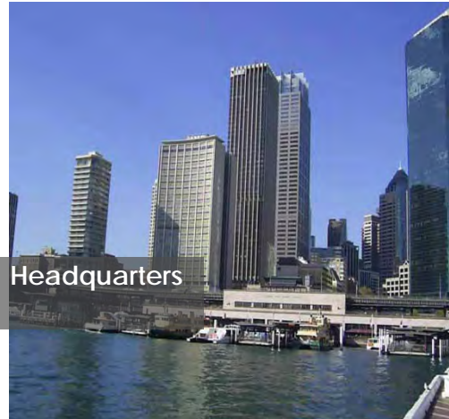
AMP Global Headquarters