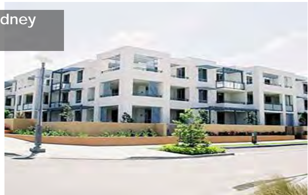
The Waterfront, Homebush Bay, Sydney

Gosford City ESD & Energy Efficiency Policy